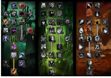
Wow classic warrior leveling guide talents.